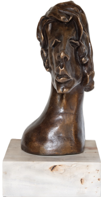
SECRET SMILE OF KNOWING (bronze – height 36 cm; weight 5,1 kg)