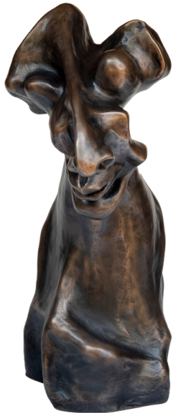
PROTEUS PRIMEVAL I (bronze – height 62.5 cm; weight 21.4 kg)