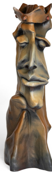
THE EMPEROR HAS A VISIBLE CROWN (bronze – height 43 cm; weight 6.9 kg)