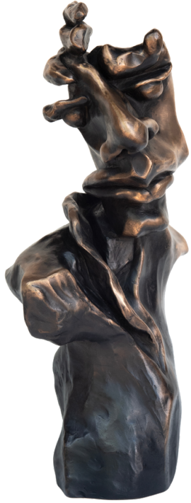
THE SURREAL WORLD OF THE DREAM (bronze – Height 43.5cm Weight 9.6kg)