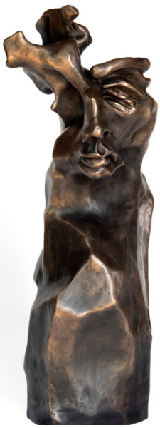
PHANEROSIS OF SPIRIT OF METSAVANA I (bronze – height 55 cm; weight 12.9 kg)