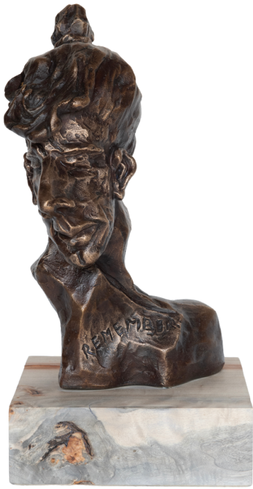
REMEMBIR (bronze – height 39,5 cm; weight 6,6 kg)