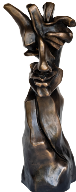
THE CLOWN (bronze – height 60.5 cm; weight 12.9 kg)