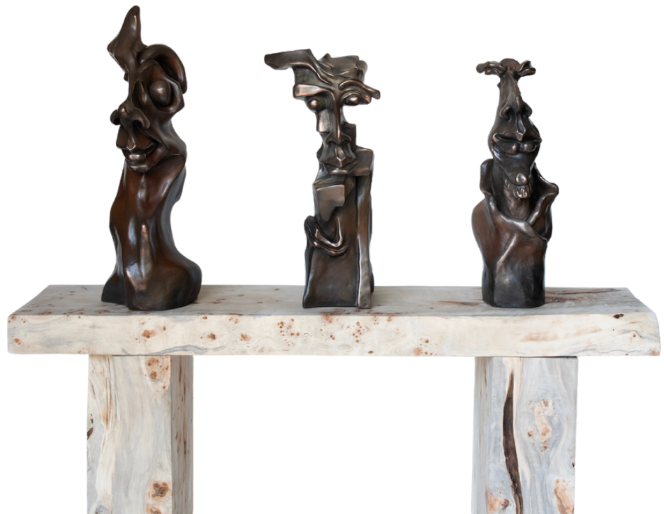
3 PHASES 3 FACES UNIT Left: Humble beginnings (bronze - height 58 cm; weight 10.9 kg) Middle: From Stone to Flight (bronze - height 48 cm; weight 10.9 kg) Right: Consciousness: Some Nose, Some Don't (bronze - height 46 cm; weight 9.5 kg)