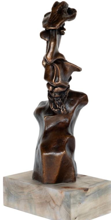
JAZZ MUSICIAN (bronze – height 44 cm; weight 6,4 kg)