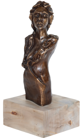
A GENTLE MOMENT (bronze – height 30.5 cm; weight 2 kg)