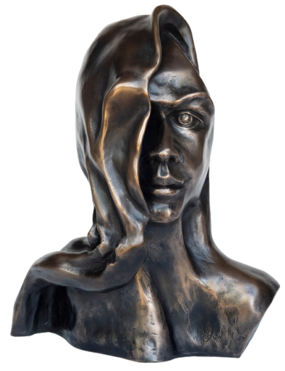
WISDOM SOPH(IA) (bronze – height 42.5 cm; weight 13.7 kg)