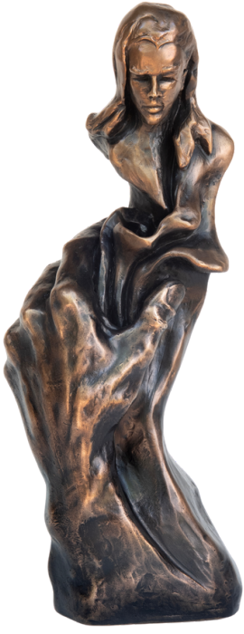
LIFE FROM LIFE - CREATIVE FORCE (bronze – Height 42,5cm Weight 8,1kg)