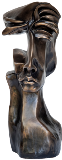
MODERN HUMAN PHENOTYPE (bronze – height 44 cm; weight 9.4 kg)