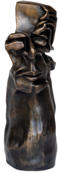
PROTEUS PRIMEVAL III (bronze – height 43.5 cm; weight 11.2 kg)