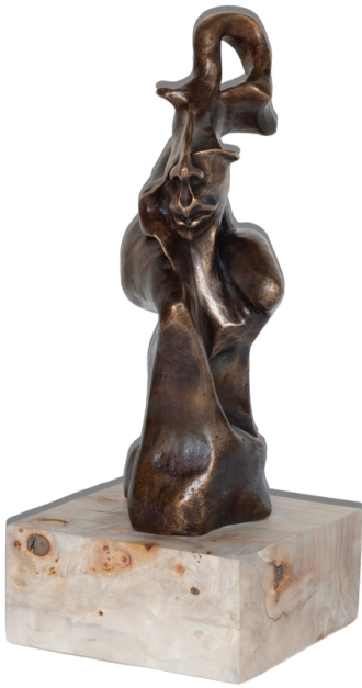
LOVERS' MERGENCE (bronze – height 33,5 cm; weight 2,5 kg)