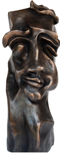
PROTEUS PRIMEVAL II (bronze – height 57.5 cm; weight 19.9 kg)