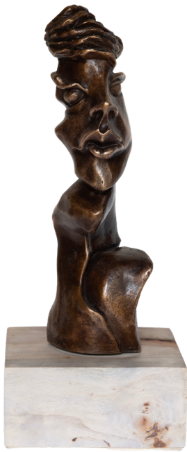
FRIDAY 17th AN ANGLE CAME TO VISIT (bronze – Height 34cm Weight 2,5kg)