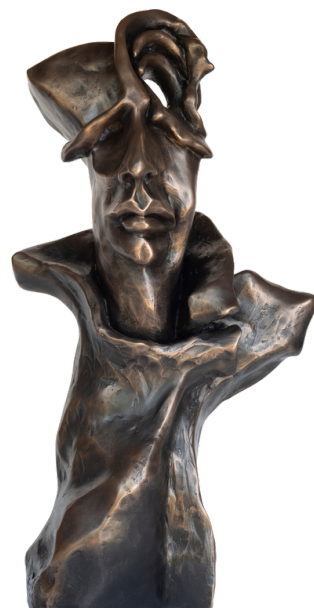
PHANEROSIS OF SPIRIT OF METSAVANA II (bronze – height 59 cm; weight 18 kg)