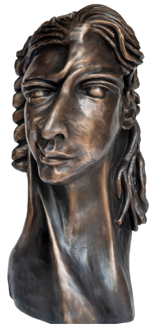
BIRTHING OF JANUS (bronze – height 63.5 cm; weight 24.7 kg)