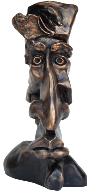
BUILDING BLOCKS - MAN (bronze – Height 36cm Weight 10.0kg)