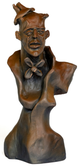
REFLECTING: WE ARE OUR MEMORIES (bronze – height 38.5 cm; weight 5.8 kg)

Submerging into Flow nurtures our spirit & allows us to grasp the reason as we become us