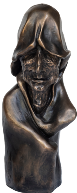
CHARON FERRYMAN (bronze – height 40.5 cm; weight 9.3 kg)