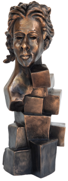
BUILDING BLOCKS - WOMAN (bronze – Height 32cm Weight 5.5kg)